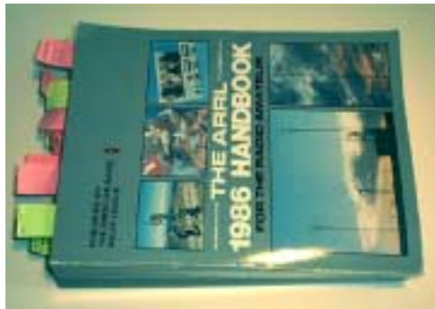
The ARRL Handbook , 1986 edition

An R&D hobbist can't hire a staff of underlings and consultants, but he can get advice from guys who have done it all before. The first investment a new ham should make is The ARRL Handbook for the Radio Amateur . These handbooks are as big as a phone book. It is published every year and the latest edition has all you need to understand the breadth of our hobby. It will also give you a good background in basic electrical principles and some detailed descriptions of do-it-yourself construction projects.