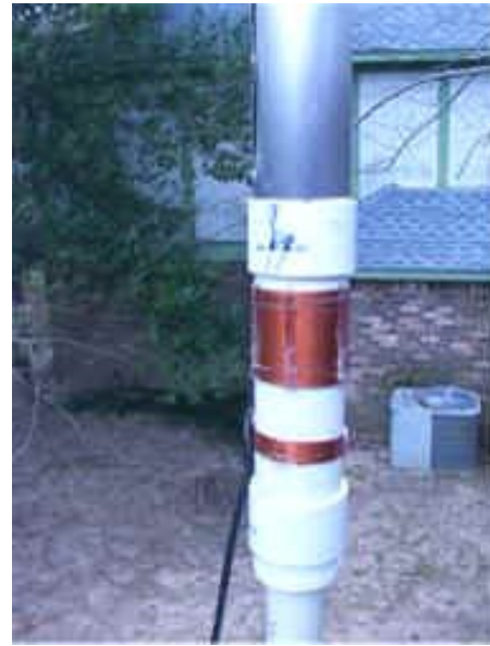
Tuning and Source Coil

I cut two pieces of the aluminum flashing 8 1/2" X 30 1/2". This is used to make the cylinders. Cut 2 pieces of PVC pipe 36 inches. On one of the pieces mark the pipe 3/4" from the end. Bend the flashing around the pipe starting at the mark. This will be for the top cylinder. Secure the flashing with self tapping screws. Drill a hole and mount a 8 x 32 bolt 1/4" above the end of the cylinder. This will be the bottom end of the top cylinder.