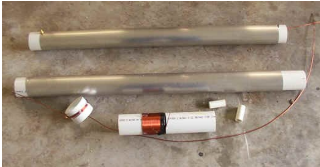
Component parts before assemble

I drilled a small hole to start winding the Phasing coil on one of the 2" PVC Couplings. The hole will also be used to place the wire down the middle of the cylinder, making sure the wire will reach the bottom of the Tuning Coil (I left 5 feet). Secure the winding using hot glue. I made each item (cylinders, coils) and then assembled them. It is easier to handle the smaller pieces.