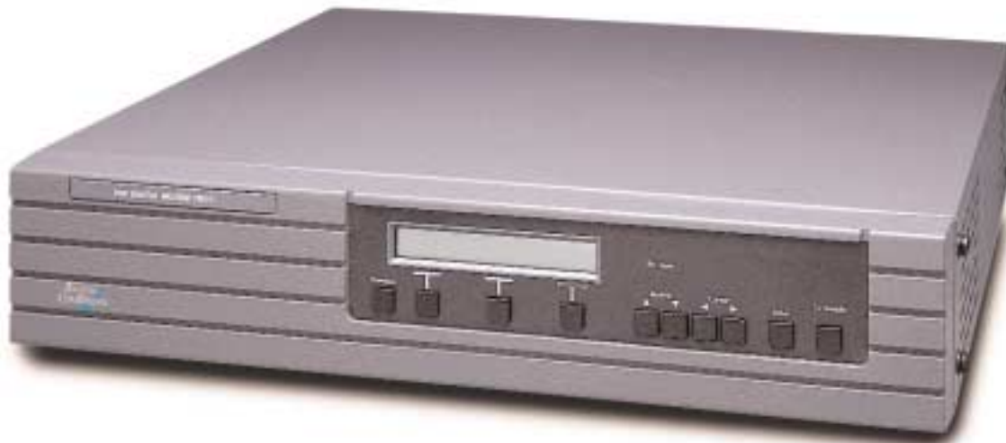
CM701A PSK Digital Satellite Modem