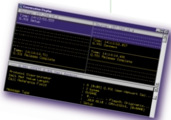
FIREBERD DNA-323's Conversation Display view provides thorough Q.931 data in plain English.

Due to the complicated call set-up and tear-down nature of H.323, call signaling analysis is vital to verify call connectivity. Because the call signal information carried in the Q.931 Call Control Message is typically segmented over a number of packets, technicians need an analyzer that re-assembles protocol data units. FIREBERD DNA-323 exceeds the capabilities of traditional protocol analyzers by performing this key task in addition to providing complete decode of the H.245 protocol stack and displaying session-end handshaking in an easy-to-interpret format.