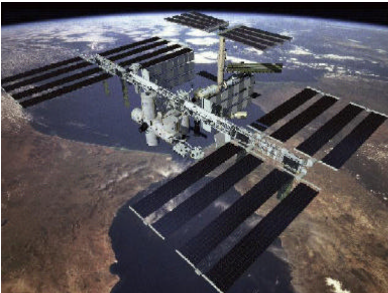
Artist's concept of the completed International Space Station

More than four times as large as the Russian Mir space station, the completed International Space Station will have a mass of about 1 million pounds. It will measure about 360 feet across and 290 feet long, with almost an acre of solar panels to provide electrical power to six state-of-the-art laboratories. The first two station modules, the Russian-launched Zarya control module and U.S.-launched Unity connecting module, were assembled in orbit in late 1998.