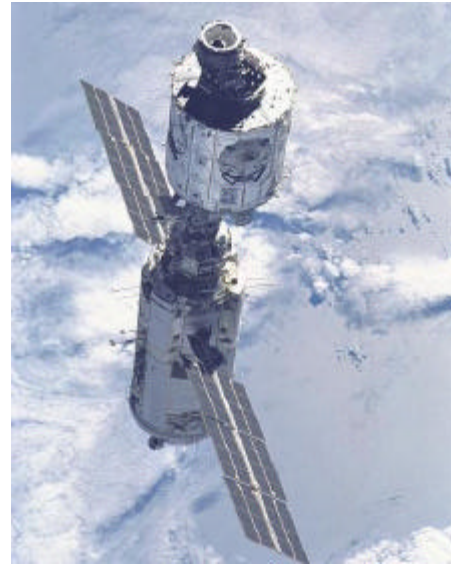
Unity (top) and Zarya in orbit

The United States has the responsibility for developing and ultimately operating major elements and systems aboard the station. The U.S. elements include three connecting modules, or nodes; a laboratory module; truss segments; four solar arrays; a habitation module; three mating adapters; a cupola; an unpressurized logistics carrier and a centrifuge module. The various systems being developed by the U.S. include thermal control; life support; guidance, navigation and control; data handling; power systems; communications and tracking; ground operations facilities and launch-site processing facilities.