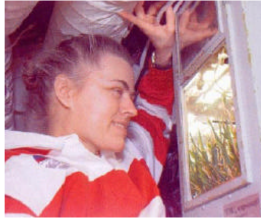
Astronaut Shannon Lucid checks wheat plants grown aboard the Russian Mir Space Station in 1996. More advanced studies on the International Space Station will analyze the effects of weightlessness on humans, plants and animals.