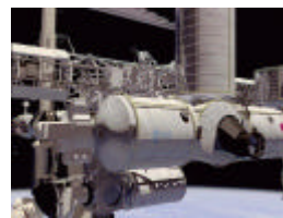
ESA Columbus Lab