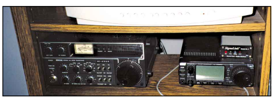
The "shack end" of my OSCAR 40 station. At the left is the IC-451 all-mode 70-cm transceiver. My IC-706 transceiver (right) serves as the microwave receiver. I can operate from this desk or, when the spirit moves me, I can drag everything out to the patio for a little "satellite al fresco ."

absolutely must have the convenience of adjusting the antenna position from the comfort of your shack.