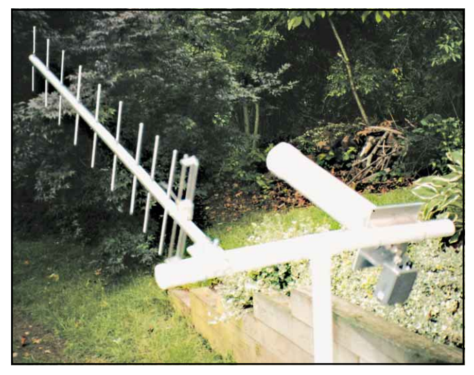
This is yet another incarnation of my OSCAR 40 antennas, this time using the Down East Microwave helical antenna (the glaringly white plastic tube aimed at the heavens). I find that I achieve somewhat better performance from the dish, but the helical antenna does an adequate job—especially when I have the 2.4-GHz preamp in the line.

My portable OSCAR 40 antenna system with the barbecue grill dish attached. The tripod was purchased at RadioShack and the PVC is courtesy of my local hardware outlet. I can set up my antennas in about 15 minutes.