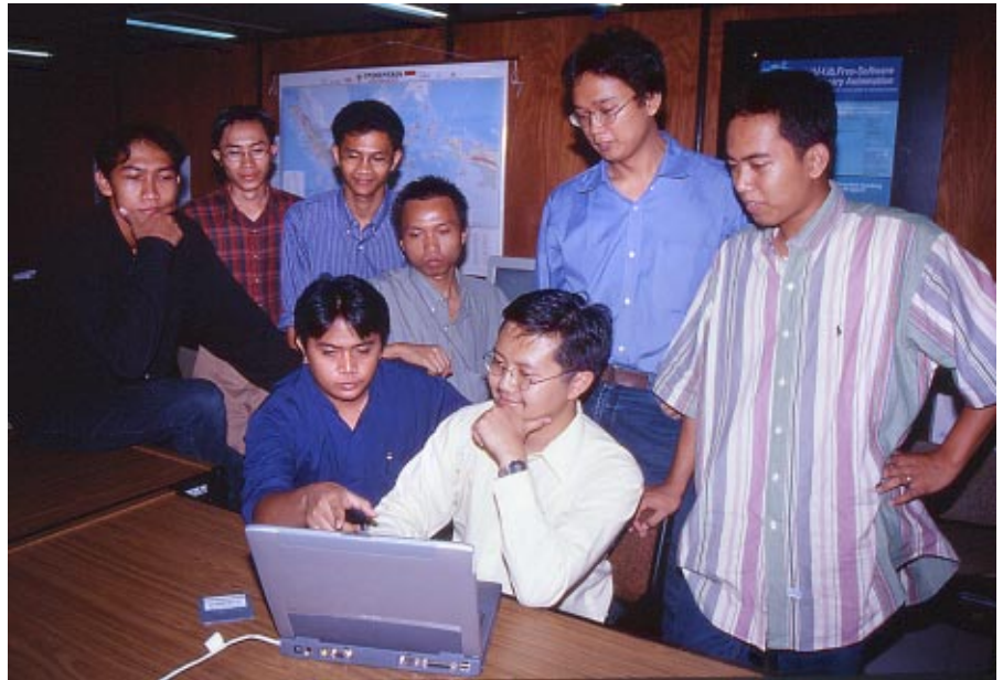
The KMRG team of software specialists at work on GDL Version 4.